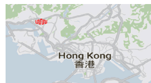
HK3 Hong Kong IBX Data Center